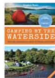
CAMPING BY THE WATERSIDE

Published by Bloomsbury. Paperback £16.99