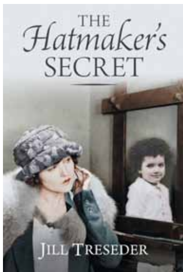
The Hatmaker's Secret