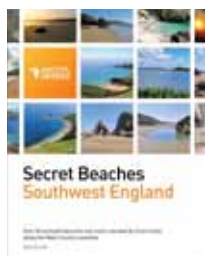
SECRET BEACHES SOUTHWEST ENGLAND

Published by Waverley Books. Paperback £7.99