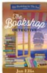
THE BOOKSHOP DETECTIVE

Published by SilverWood Books via web site and Amazon. Paperback £9.99